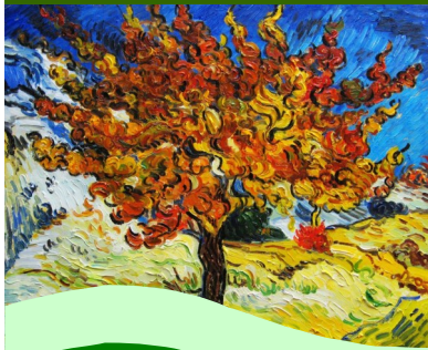
The Mulberry Tree, Saint-Rémy: October, 1889 by Vincent van Gough Norton Simon Museum Pasadena CA

"I will be serving as Deacon for the Pride Eucharist at All Saint's Episcopal Church on Thursday evening October 6th, in Atlanta at 7:30 p.m. I realize that is a week night and a drive! So, if you can't attend, I know you will be there in spirit as I represent our convocation."